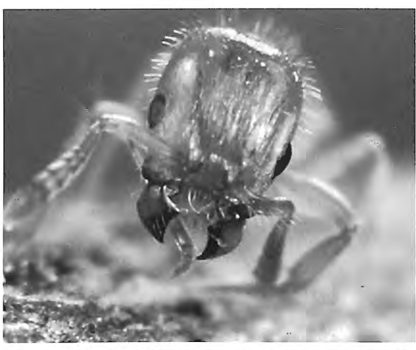
Fig. 2. Detail of the head and mandibulae of Harpagoxenus sublaevis.

authors suggest that the species is an ice age relict ("nacheiszeitliches Relikt") because of its boreal-alpine distribution. In France the species is only known from the Pyrenees and the Alps (ANONYMUS, 2006). The new record from the Hautes Fagnes might be seen in this boreal-alpine context. However records from lowlands in Niedersachsen (SONNENBURG, 2005) do not confirm this theory.