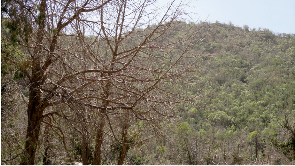
Figure 8. Type locality, Amadan forest, Al Mandaq governorate, Al Bahah province, Kingdom of Saudi Arabia.