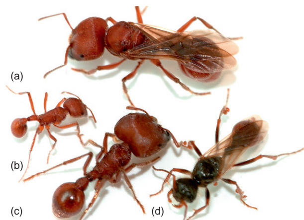
Figure 3 Example of different castes developed from totipotent eggs of the harvester ant Pogonomyrmex badius . (a) Queen (unmated, with wings still attached); (b) minor worker; (c) major worker; (d) male.

See also: Pheidole : Sociobiology of a Highly Diverse Genus; Termites: Social Evolution.