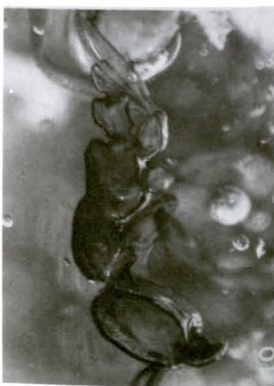
Figures 9 - 12. Photographs of fossilized army ants and driver ants. Scale varying. Figures 9 - 10. Neivamyrmex iridescens . Figure 9. Damaged specimen (damaged previously by polishing). Figure 10. Worker, lateral view. Figures 11 - 12. Dorylus molestus . Figure 11. Numerous workers in copal. Figure 12. Major worker, lateral view.