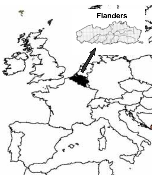
Figure 1. Location of Flanders, the northern part of Belgium

In this paper we present some general conclusions on the distribution and diversity of the ants of Flanders (Figure 1), their habitat width is discussed and a provisional Red List is proposed. We also evaluate habitat types for which ants can be used as indicators and provide a list of species that should be monitored in these habitats and which can be used to evaluate sites when used with species from other invertebrate groups.