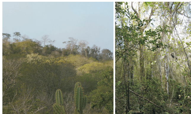
Fig. 2. View of the site surveyed for ants in Milagres, Bahia, Brazil. a) General view of the arboreal caatinga, and b) View of the understory.

In addition, we actively searched for ants in the study areas, like in the soil, plants, fungus, rotten wood, fallen leaves and under rocks, to complement the list of species.