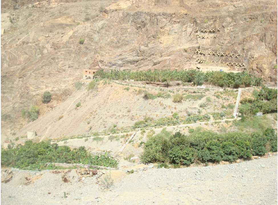
Figure 13. Type locality, Al Bahah, Mukhwah Aqaba RD.

that in Tihama although they are separated by no more than 30 km. The weather is cooler in summer and winter due to its high altitude. Al-Sarah is exposed to the formation of clouds and fog, and this often happens in winter because of air masses coming from the Red Sea, accompanied by thunderstorms. In spring and summer, the climate is mild and pleasant. Also, rainfall is higher with falls in the range of 229–581 mm. The average rain falls throughout the whole province is 100–250 mm annually