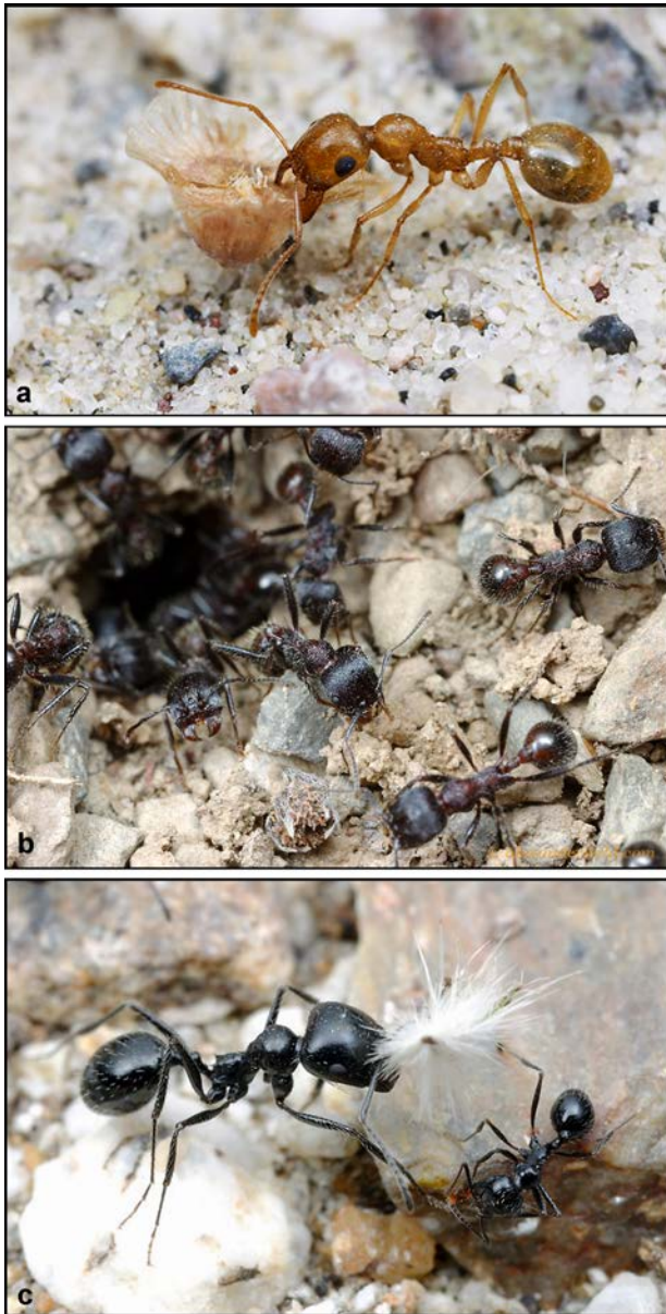
Fig. 3: New World Messor : a) Nocturnal species of Messor are pale in color, like this M. lariversi forager. b) Monomorphic M. andrei exiting a nest entrance, California, USA. c) Polymorphic M. pergandei workers carrying seed along a trail.

among these three species suggest that group foraging has evolved at least twice in New World Messor (BENNETT 2000, JOHNSON 2001).