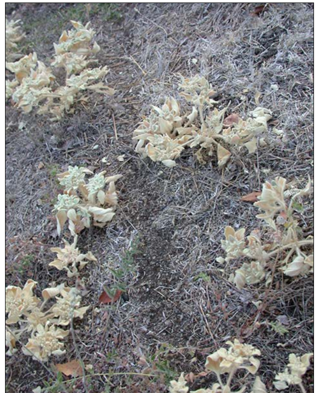
Fig. 1: Trunk trail (runs vertically through photograph) cleared by a Nearctic Messor , M. andrei , California, USA.

Group recruitment is when a leader ant uses motor displays to induce 5 - 30 workers to follow a short-lived odor trail, such as occurs in several Camponotus species (HÖLLDOBLER 1971a), Aphaenogaster cockerelli , A. albisetosus (HÖLLDOBLER & al. 1978), A. senilis (CERDÁ & al. 2009),