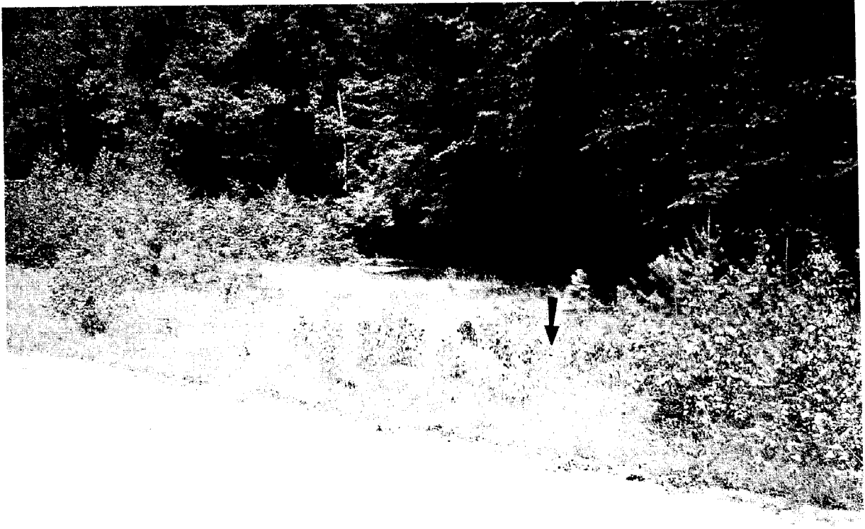
Fig. 2. Habitat of Formica glauca in Puszcza Białowieska (location of the nest is marked with an arrow).

The colony of F. glauca in Puszcza Białowieska (N-E Poland) is situated not far from the village of Topiło near Orzeszkowo (forest inspectorate Hajnówka, forest district Starzyna, forest division 632; 52°38'N, 23°31'E, UTM FD74), outside the National Park. It was discovered in 1992 and has been inspected