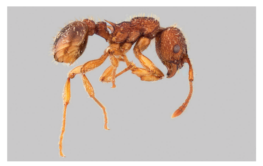
Figure 2. A worker of M. sabuleti , heavily infected with R. wasmannii on all body parts.

monophyly of these morphological species groups was confirmed using molecular data (Jansen et al. 2010). So far, only species of the rubra -group and scabrinodis -group have been found with Rickia wasmannii infection.