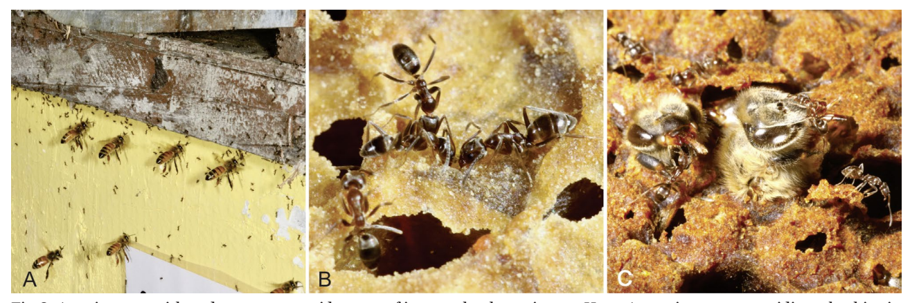
Fig. 2: Ants interact with and prey upon a wide array of insects that host viruses. Here, Argentine ants are raiding a beehive in New Zealand. (A) Honey bees appear to be stressed by ant raids but can do little to deter ants. (B) The ants consume brood and honey, and (C) swarm over emerging bee adults. Some viruses have been found to replicate in bees, Argentine ants and other arthropods (e.g., Deformed wing virus, Kashmir bee virus, Moku virus) (DOBELMANN & al. 2020). These and other viruses might be generalist viruses of insects. Other viruses found in honey bees appear to have a more restricted host range (e.g., Black queen cell virus).

specific to ants in the genus Solenopsis (PORTER & al. 2013, PORTER & al. 2015) whereas some other viruses are found in a diversity of arthropods.