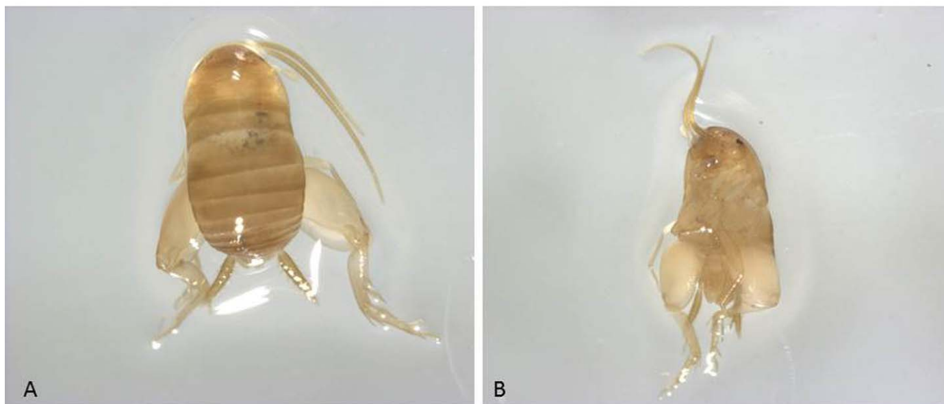
Fig. 1. The dorsal (A) and ventral (B) sides of a Myrmecophilus nebrascensis individual from Beaver County, Oklahoma.