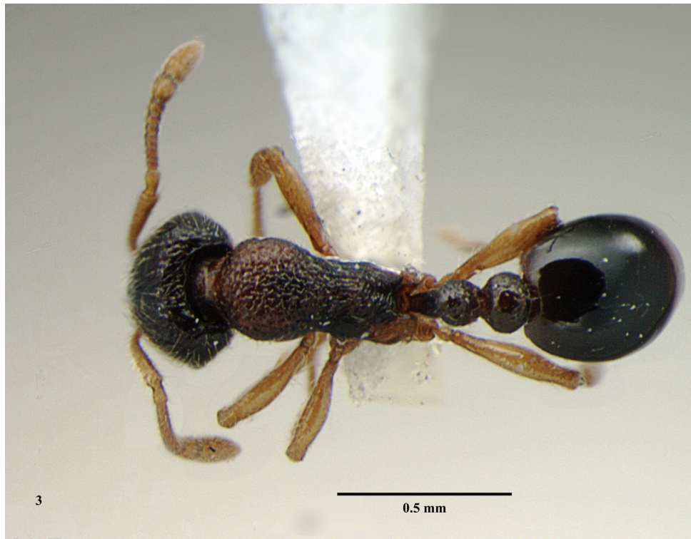
Fig. 3. Lordomyrma mewasinghi sp. nov. Body in dorsal view

In profile view, promesonotum fairly convex. Mesometanotum suture weakly impressed. The propodeal dorsum not straight, generating downward sloping curve. Propodeal declivity concave, and propodeal lobes triangular and longer than propodeal spine. Petiolar node convex dorsally. Petiolar node is thick and trapezoidal with roundly convex dorsum; the anterior peduncle significantly shorter than length of node, with small ridge extending from anteroventral corner. Postpetiolar node with roundly convex dorsum with nearly straight ventral edge, and sharply toothed anteroventral corner.