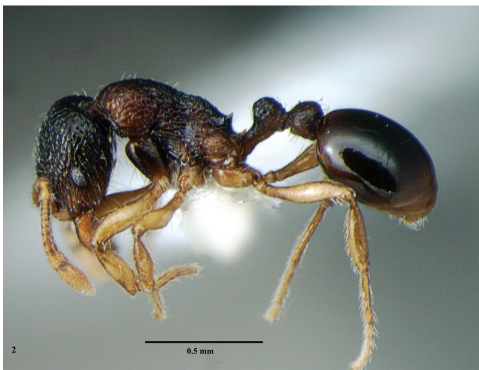
Fig. 2. Lordomyrma mewasinghi sp. nov. Body in profile view