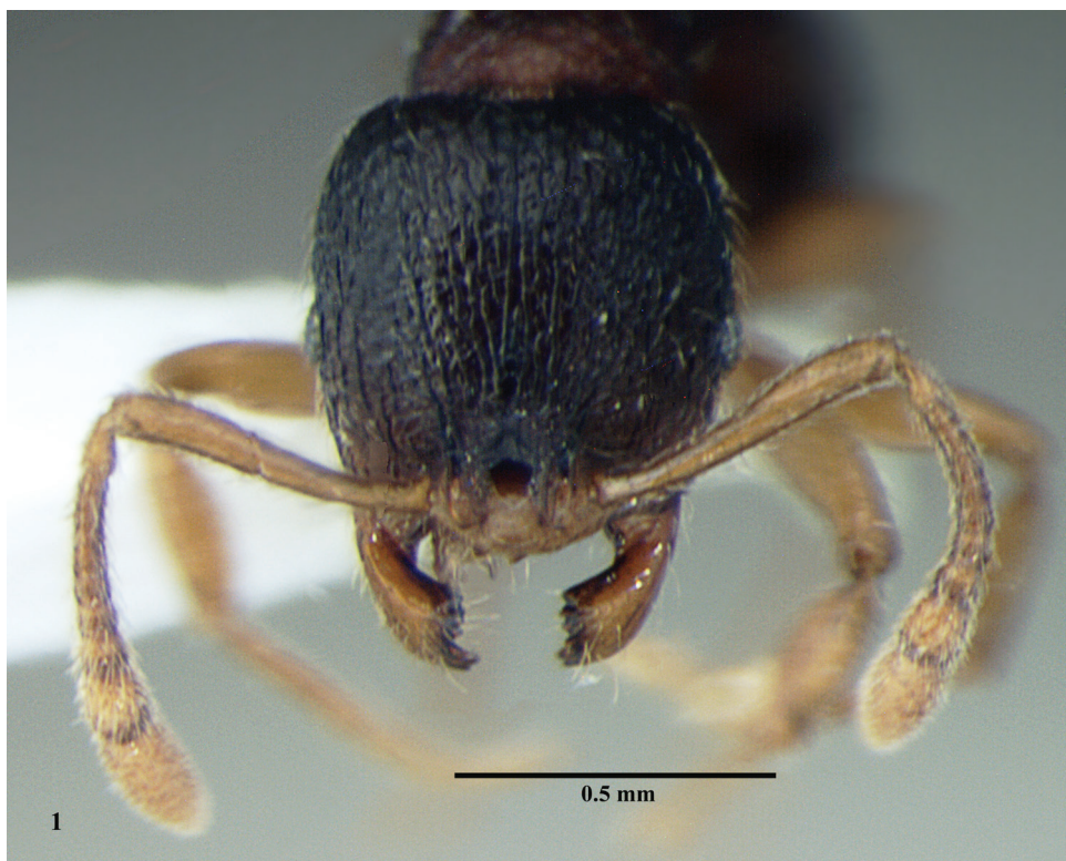
Fig. 1. Lordomyrma mewasinghi sp. nov. Head in full face view