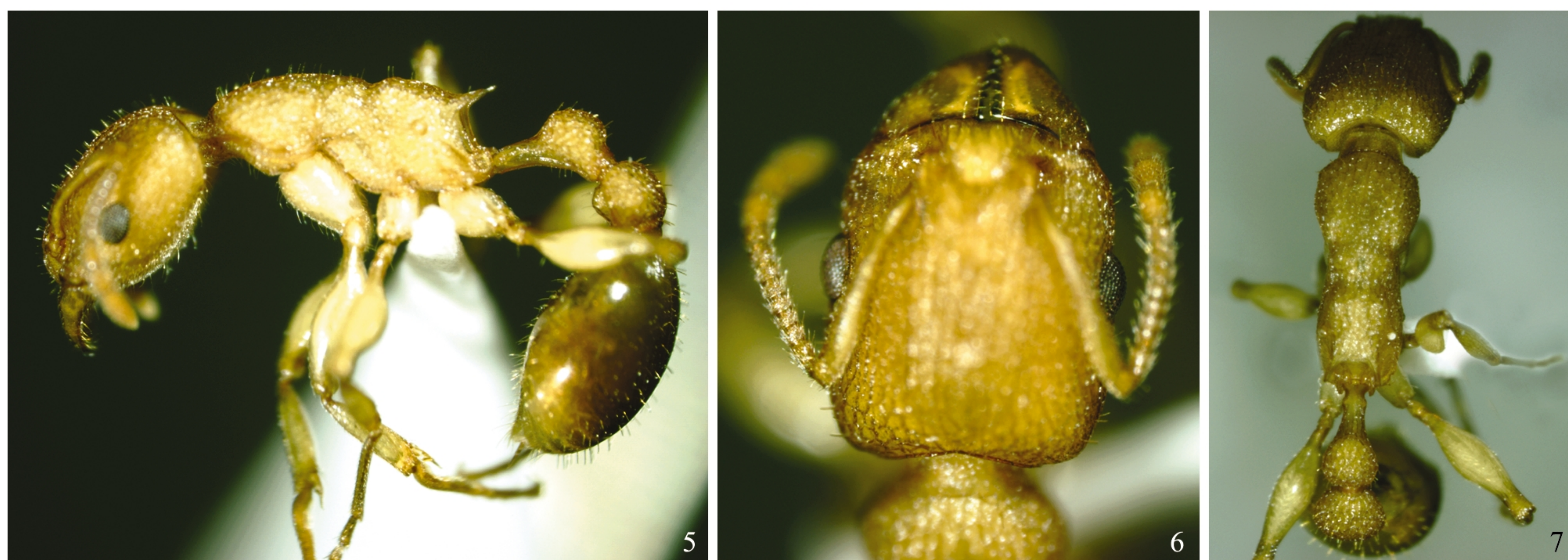
Figs 1 – 7. Worker of Paratopula zhengi sp. nov. 1. Head in full face view. 2. Head and body in profile view. 3. Alitrunk, petiole, postpetiole, and gaster in dorsal view. 4. Hind leg in front view. 5. Head and body in profile view. 6. Head in full face view. 7. Head and body in dorsal view.

roundly prominent. Lateral sides nearly parallel, slightly narrowed forward. Mandibles triangular, masticatory margin with 9 teeth which decreased in size from apex to base. Anterior margin of clypeus distinctly notched in the middle, posterior median portion between frontal lobes distinctly wider than the latter. Antennae 12-segmented, antennal club 3-segmented. Apexes of scapes reached to 4/5 of the distance from antennal sockets to occipital corners. Frontal carinae weakly developed and parallel, about as long as antennal scapes. Eyes developed, located slightly before the midpoints of lateral sides of head, with about 13 facets across the maximum diameter.