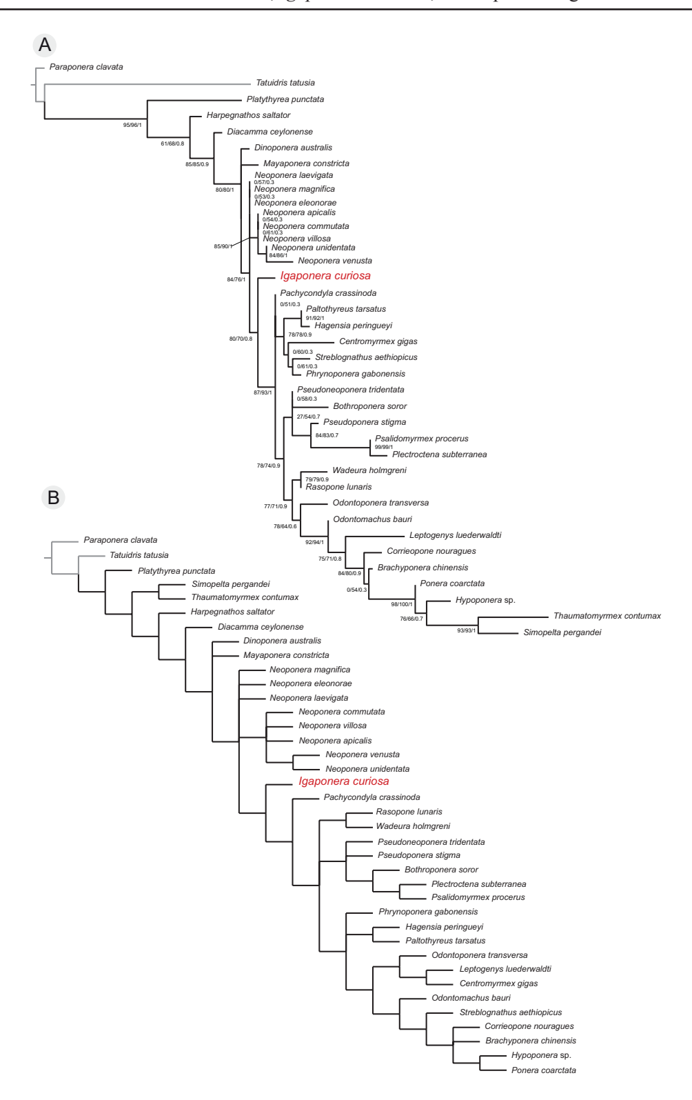
Fig. 1 . Morphology-based consensus phylogenies depicting the placement of Igaponera gen. nov. within the Ponerinae (Formicidae). The trees were inferred through: A . maximum likelihood in IQ-TREE, and B . maximum parsimony in TNT, using a data set composed of 36 characters and 38 terminals: 36 ingroup taxa, and two outgroups (branches in grey). The numbers next to nodes represent statistical support (SH-aLRT/Bootstrap/aBayes) and are only provided in the maximum likelihood tree (see Material and methods).