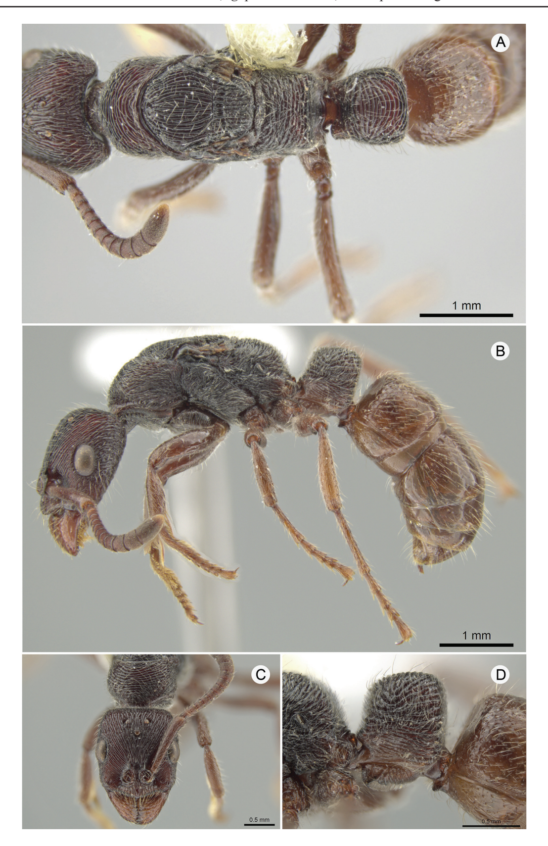
Fig. 3 . Igaponera curiosa (Mackay & Mackay, 2010), holotype queen. A . Body in dorsal view. B . Body in lateral view. C . Head in frontal view. D . Petiole in lateral view. Additional images available on AntWeb (www.antweb.org). Scale bars: A–B = 1 mm; C–D = 0.5 mm.