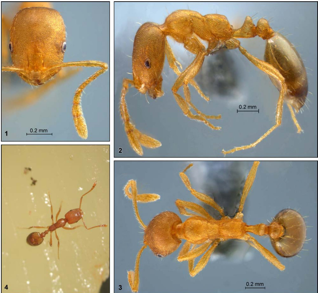
Figs. 1 - 4: Monomorium pharaonis . (1) Head of worker from Luzon, Philippines; (2) lateral view of the same worker; (3) dorsal view of the same worker; (4) worker foraging indoors on gouda cheese in Lower Austria, Austria (1 - 3 by D.M. Sorger, copyright NHMW Image Database & www.antbase.net; 4 by B.C. Schlick-Steiner & F.M. Steiner).

1851 (from India; synonymized by EMERY 1892). Finally, WROUGHTON (1892) mistakenly considered Myrmica vastator SMITH, 1857 (from Singapore) to be a synonym of Myrmica basalis SMITH, 1858 (= M. destructor ), based on mislabeled specimens in the British Museum. DONISTHORPE (1932), however, concluded "it is clear that the type of M. vastator SMITH is at Oxford, and that the species is really M. pharaonis L."