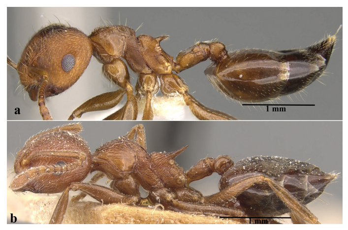
Figure 4. Body in profile view, a) C. rogenhoferi Mayr, 1879 (From AntWeb- CASENT0914078, Photographer- Z. Lieberman), b) C. himalayana Forel, 1902 (from AntWeb- CASENT0908582, Photographer- Will Ericson).

Figure 3. Head in full face view and body in dorsal view, a, b) C. rogenhoferi Mayr, 1879 (AntWeb-CASENT0914078, Photographer- Z. Lieberman), c, d) C. himalayana Forel, 1902 (AntWeb-CASENT0908582, Photographer- Will Ericson).