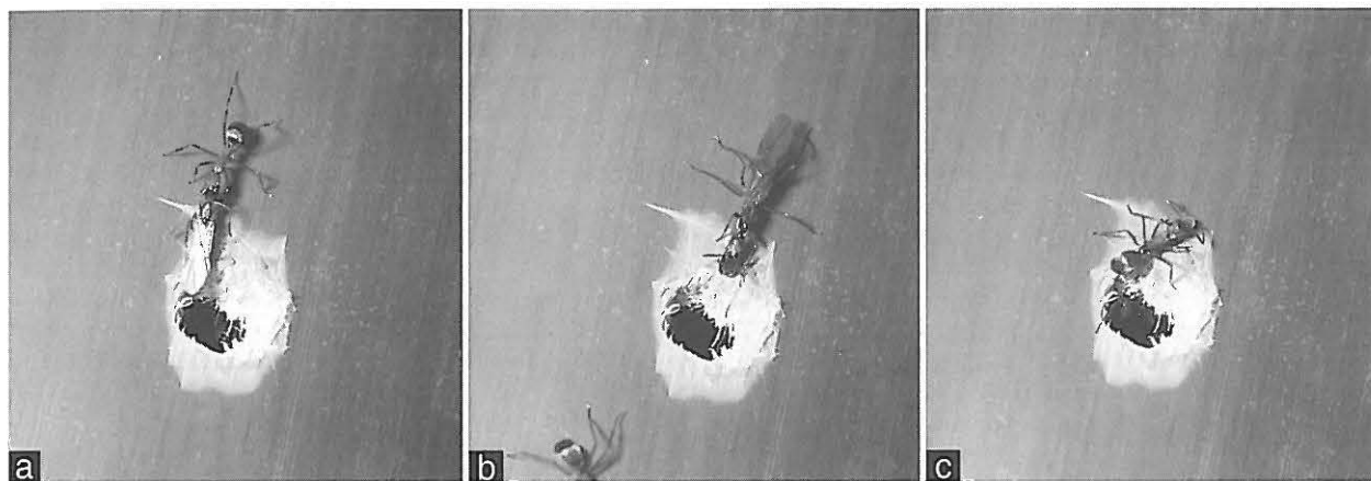
Fig. 1. Nest movement of Polyrhachis schellerichae . — a) Males are carried by the neck; b) queens walk by themselves, and c) trophobionts are taken between the mandibles and carried to the new nest.

In all tests the recruited ants found their way to the bait independently without any leading animal. Some P. schellerichae workers showed a characteristic behaviour when heading back to the nest or again from the nest to the food source. They moved forward at a slow pace and pressed their gaster tip to the ground at frequent intervals. This behaviour is known from other ant species when laying odour trails (HÖLLDOBLER & WILSON 1990).