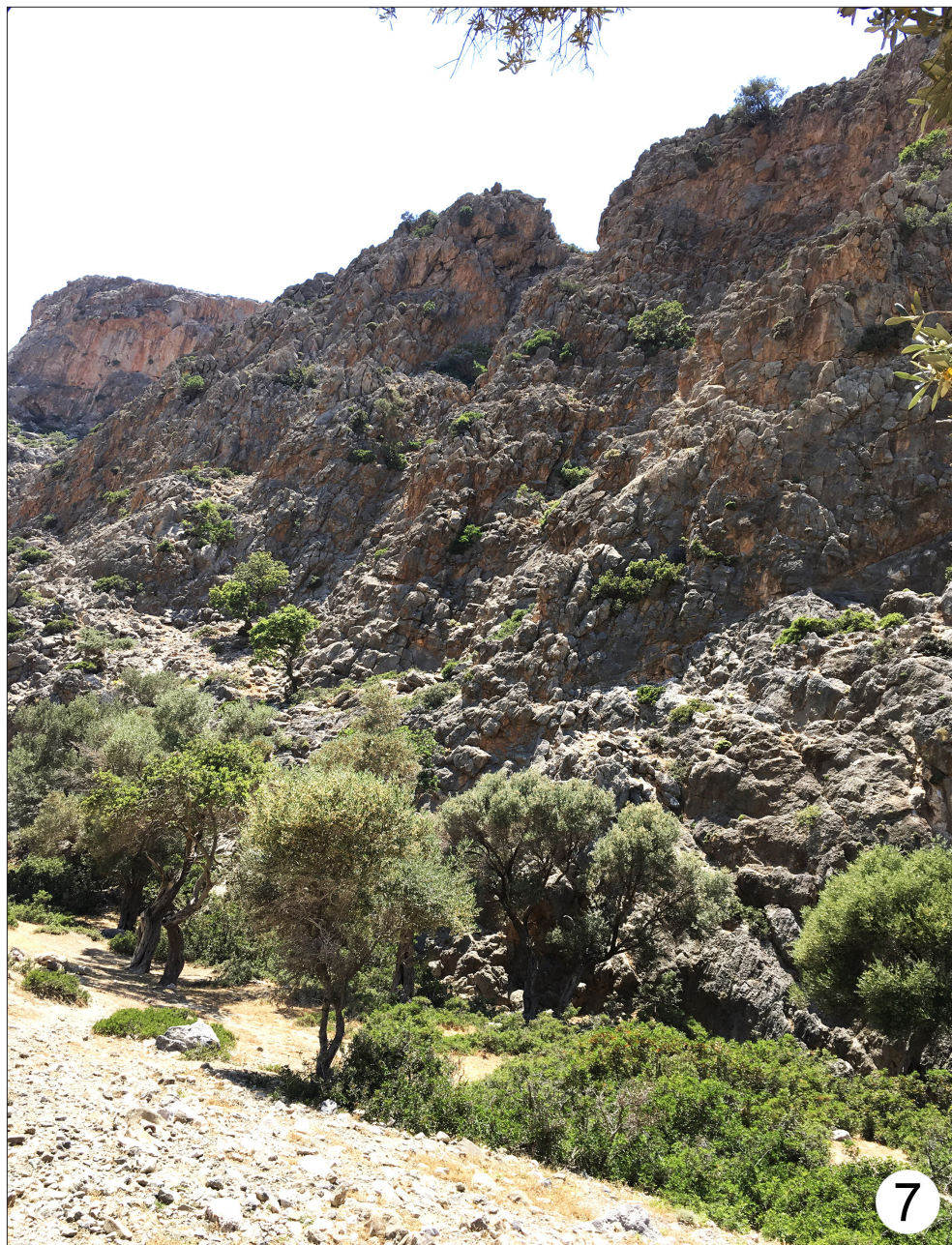
Fig. 7. Habitat at the site where Monomorium exiguum was found in Crete.

Accepted: 19 October 2023; published: 30 October 2023